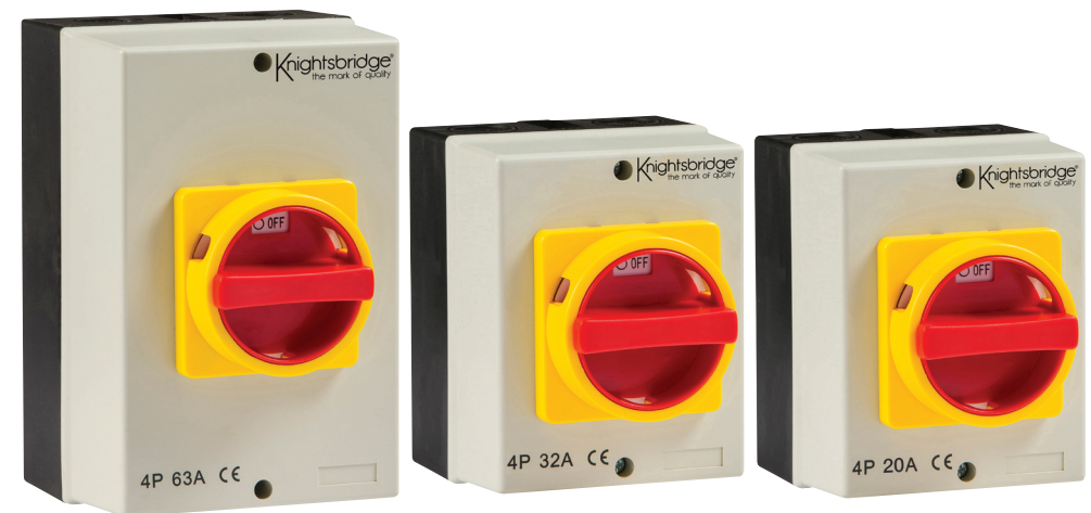
IP65 ROTARY ISOLATOR