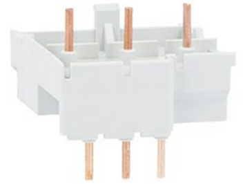
Rigid SM1 breaker-contactor connections SM1X Rigid SM1R breaker - BG contactor connections. SM1R...