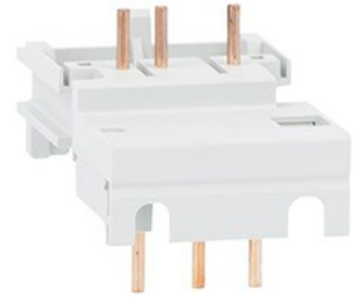
Rigid SM1 breaker-contactor connections SM1X Rigid SM1R breaker - BF09..25D and BF09...25L contactor connections. SM1R...