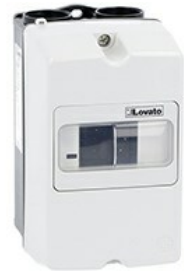
Surface mount enclosures IP65 (4X) for SM1P SM1Z Surface mount enclosures IP65 (4X) for SM1P SM1P...