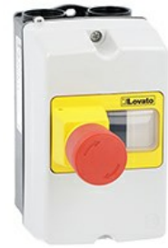
Surface mount enclosures IP65 (4X) for SM1P SM1Z Surface mount enclosures IP65 (4X) for SM1P SM1P...