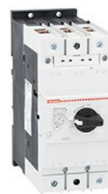
Motor protection circuit breaker SM3R