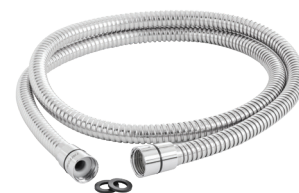
1.5m Anti-twist Hose - Chrome REHOSE150C