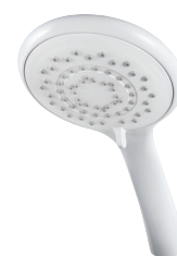
Showerhead (5 Spray Pattern) TSHE8RCWHT