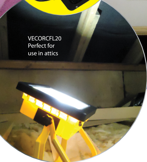
VECORCFL20 Perfect for use in attics