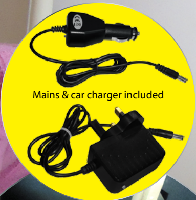
Mains & car charger included