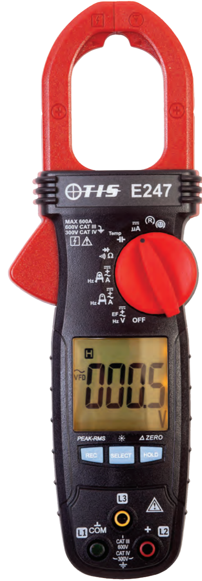
TIS E247 Digital Clamp Meter 600A AC/DC with AmpTip™ Jaws