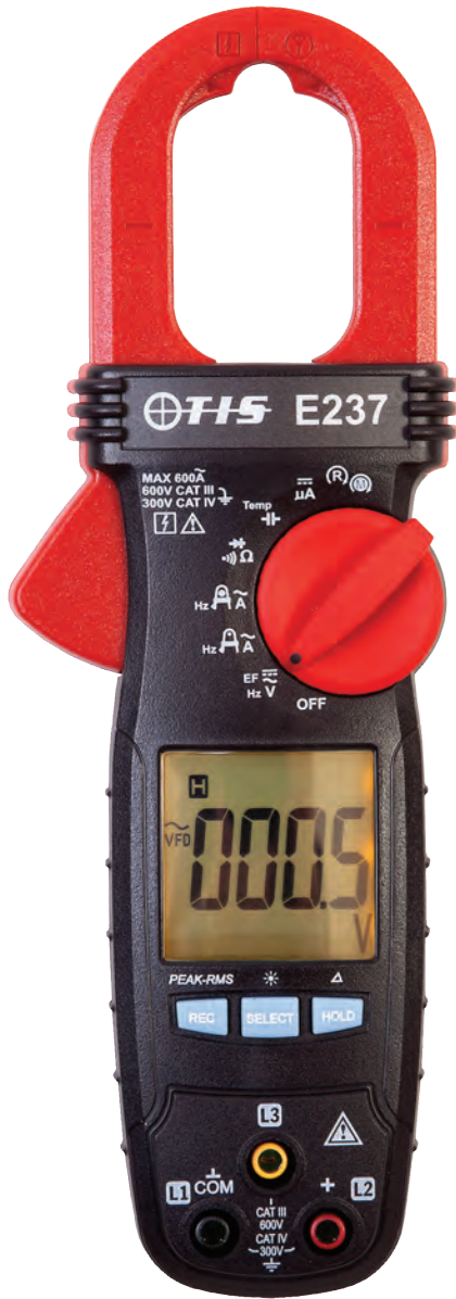
TIS E237 Digital Clamp Meter 600A AC with AmpTip™ Jaws