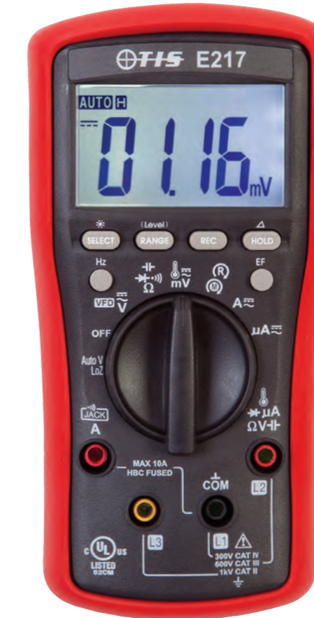
TIS E217 Electrical Multimeter