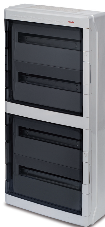
Ref. Item 39072

* Incluye 3 SPT18/36 (3 Soporte rail + 6 terminales x (11x10 mm 2 + 11x16 mm 2 )) Include 3 SPT18/36 (3 Rail support + 6 terminals x (11x10 mm 2 + 11x16 mm 2 ))