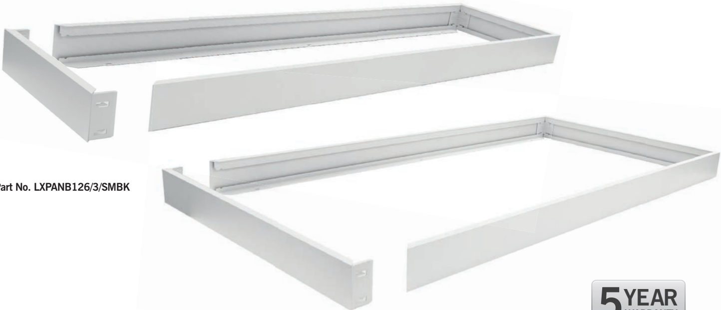
Part No. LXPANB126/3/SMBK