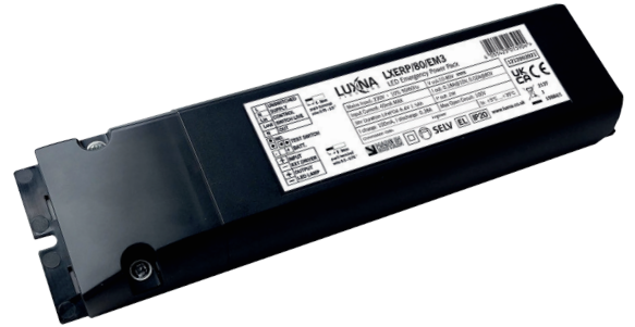
Supplied with Green LED charge indicator and mounting clip