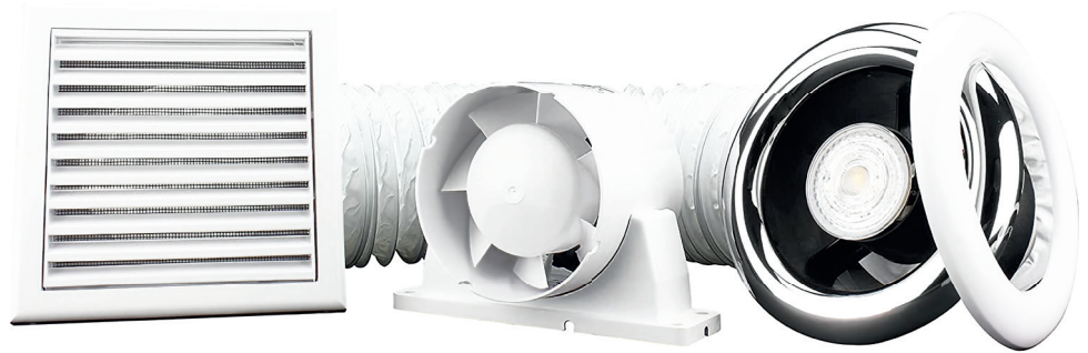
combined ceiling diffuser & 4.6k LED light

Supplied with combined ceiling diffuser & 4.6k LED light: 4000k MR16 fitting.