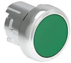
Pushbutton actuator, spring return LPSB10