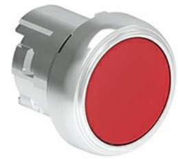
Pushbutton actuator, spring return LPSB10