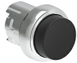
Pushbutton actuator, spring return LPSB20