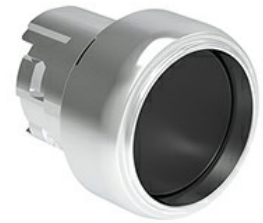
Pushbutton actuator, spring return LPSB30