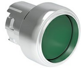
Pushbutton actuator, spring return LPSB30