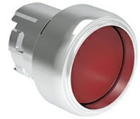
Pushbutton actuator, spring return LPSB30