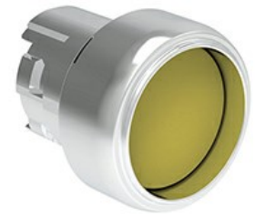
Pushbutton actuator, spring return LPSB30