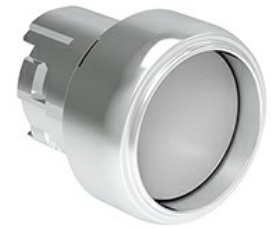
Pushbutton actuator, spring return LPSB308