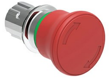
Mushroom head pushbutton, Latch, turn to release Ø 40mm/1.6" LPSB664