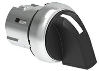
Selector switch actuators lever - 3 position LPSS13