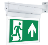
Using accessory 'Side-Mounting Arm'