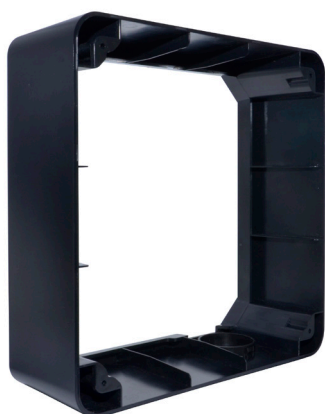
Toughened plastic surface sleeve