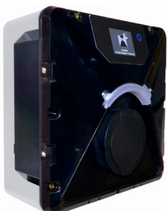
Toughened plastic box to house electrical components