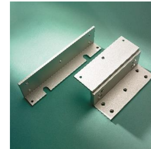
AEMBR026 Z&L Bracket to suit Inward Opening Doors