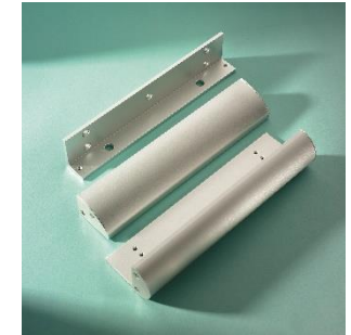
AMH595/ZA Architectural Z&L Bracket to suit Inward Opening Doors