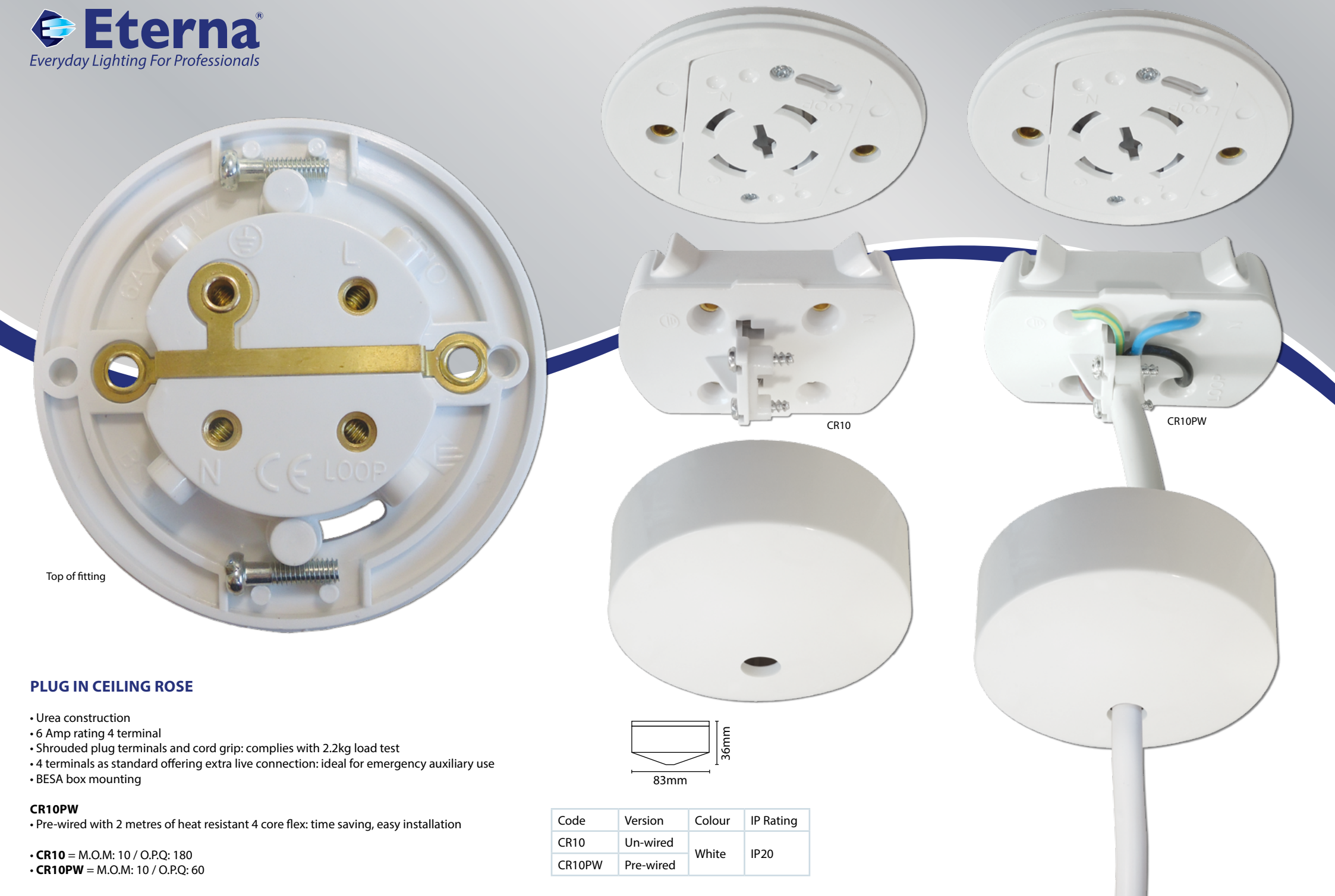
Top of fitting