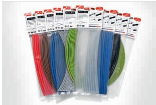
HIS-3 BAG available in seven colours and four sizes.