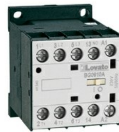
Power contactor BG09