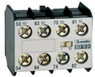
Auxiliary contact 11BGX10