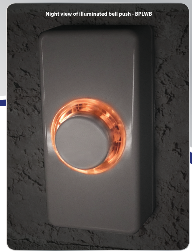
Night view of illuminated bell push - BPLWB