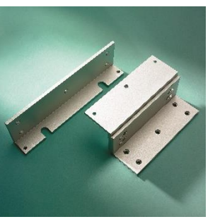
AEMBR089 Z&L Bracket to suit Inward Opening Doors

For further information contact: Securefast plc 6, The Cedars Business Centre Avon Road, Cannock Staffordshire WS11 1QJ