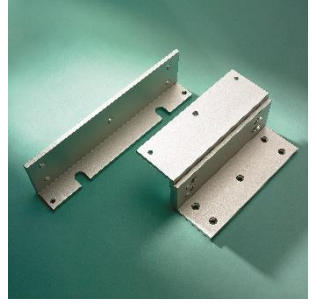
AEMBR026 Z&L Bracket to suit Inward Opening Doors