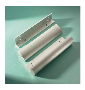
AMH595/ZA Architectural Z&L Bracket to suit Inward Opening Doors