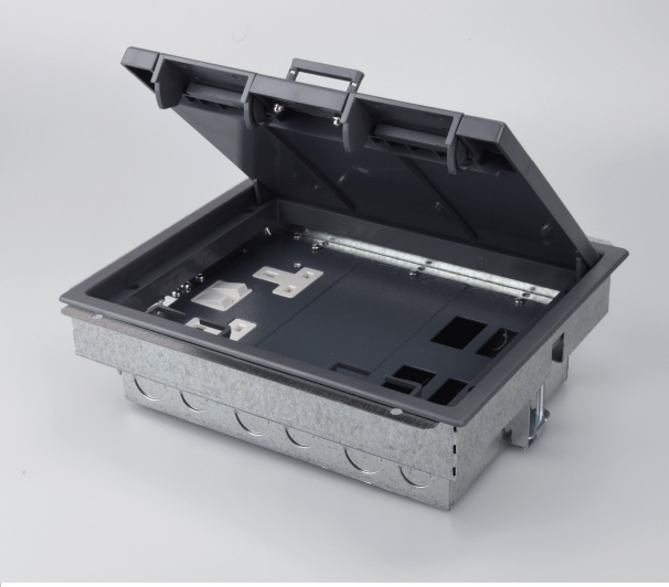
Illustration above shows TFB3s Cavity Floorbox fitted with STO300, STO301 and STO302 (plates sold seperately).